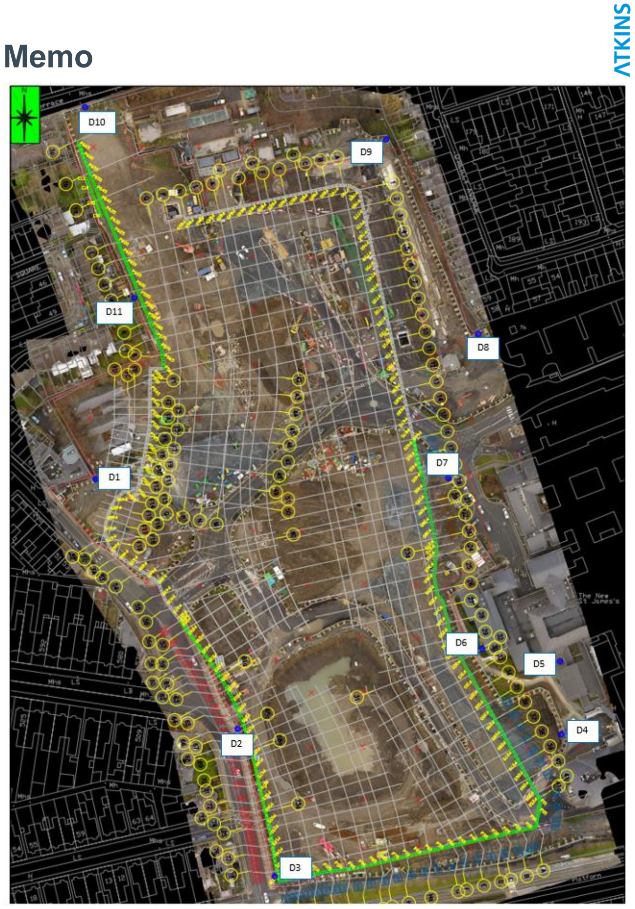
Figure 1. Location of Dust monitors on site (May 2018).